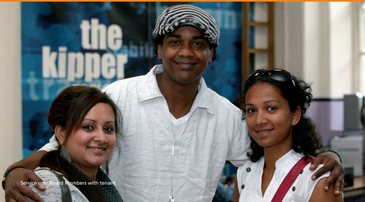
Service user Board Members with tenant

Cover photo: Olympic champion Steve Cram MBE, sporting ambassador for Clydesdale Bank, speaking at a Kipper Project event