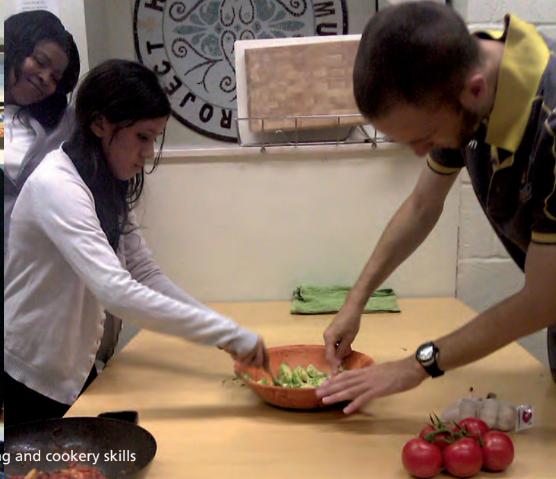
Learning budgeting and cookery skills