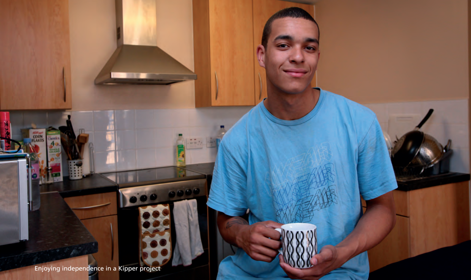
Enjoying independence in a Kipper project